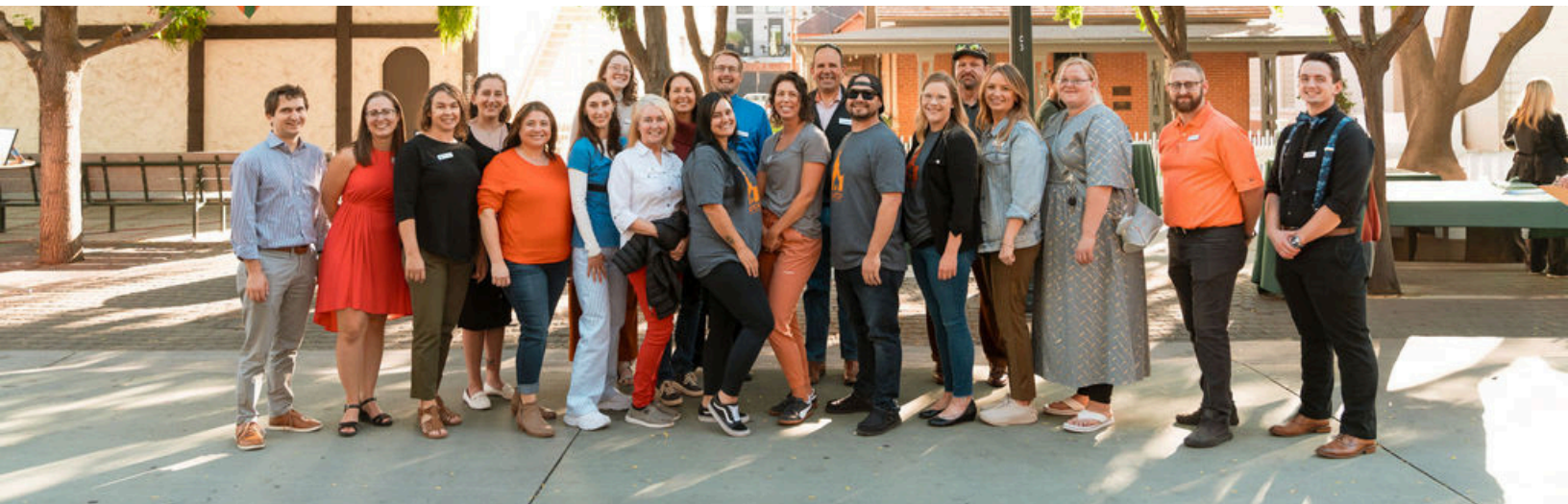
Above: CATCH the Flavor - our annual storytelling dinner aimed at fostering community and ending homelessness

CATCH exists because everyone needs a home. We work to create a safe, healthy, connected community by embracing Housing First practices, empowering those without housing, building collaborative partnerships, and increasing public understanding to make homelessness rare, brief, and non-recurring. Our vision is to end homelessness in the Treasure Valley!