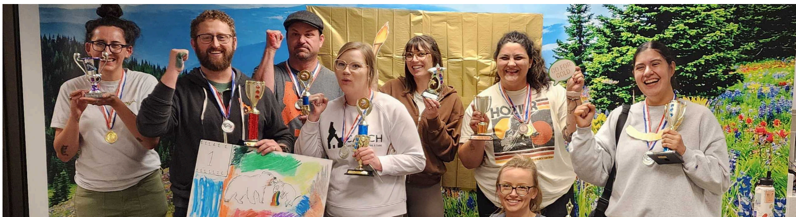
Winning teams at the CATCH Olympics pose with their medals and trophies